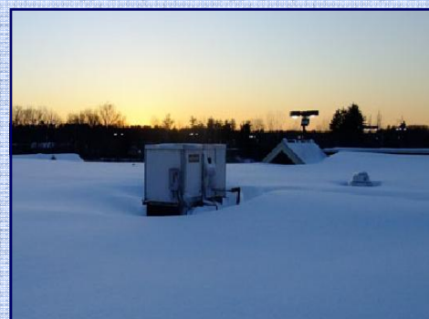
Regular, detailed inspections of roofing are crucial to asset planning.

Equally as important as the condition of a roof, is the proper operation of HVAC equipment. Neville recommends to all of their clients that preventative maintenance is performed on HVAC systems in advance of the on set of colder temperatures.