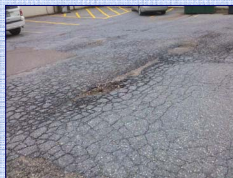
What can happen after several winters without crack filling your parking lot: aka "gatoring" (like alligator)