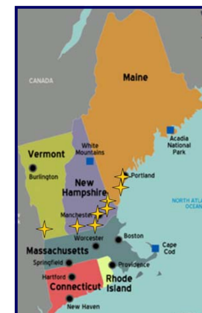
(continued on page 2)

Stop and Shop awarded Neville the contract in the fall of 2009 and with management commencing January 1, 2010.